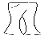
Bell Bottom Pants