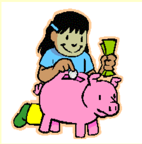
Money in the Bank.

“Bring all the tithes (the whole tenth of your income) into the storehouse, that there may be food in My house, and prove Me now by it says the Lord of hosts, if I will not open the windows of heaven for you and pour you out a blessing, that there shall not be room enough to receive it”